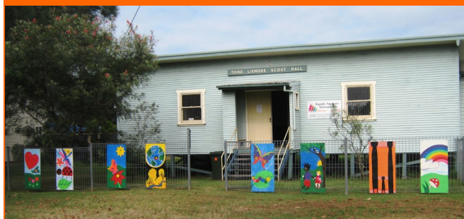
South Lismore Family Centre, 41 Wilson Street.

Family Support Network PO Box 236 143 Laurel Avenue Lismore NSW 2480 Tel: 02 6621 2489 Fax: 02 6621 5208 Email: karen@fsn.org.au Web site: www.fsn.org.au