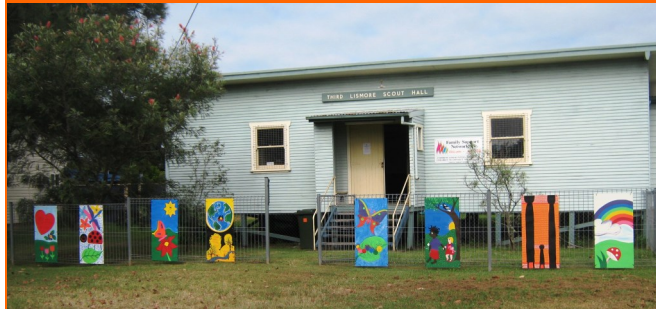
South Lismore Family Centre, 41 Wilson Street.